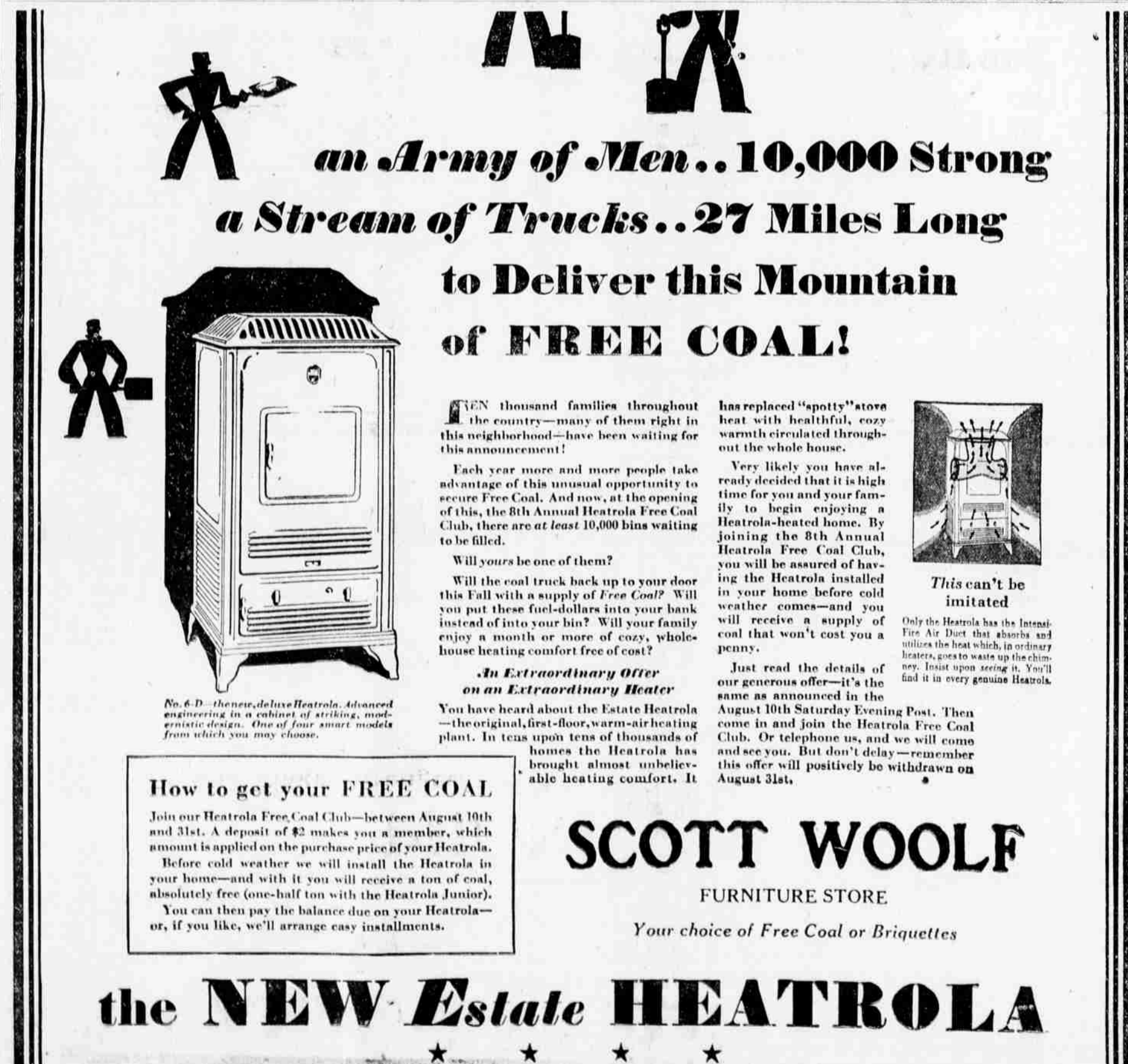
No. 6-D—the new, deluxe Heatrola. Advanced engineering in a cabinet of striking, modernistic design. One of four smart models from which you may choose.

Can Build Another Pipe Line "The city has not doubled in population since 1910, but assuming that it will double its present population within the next twenty years, it would then be too large to safely depend upon a single pipeline 3 1/2 miles long from the springs to the city, and service would demand a double supply line by that time."