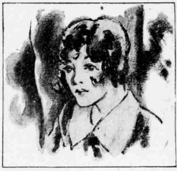
Veronica stood in the road—badly frightened but unharmed.

Chapter I TONGUES OF HATE I RETURNED home from my visit with Laxton determined to sound out Pell. The opportunity came the next day and I told him of Laxton's pertinent inquiries. Again Pell seemed on the verge of a confidence. "Hmm," said he. Then after a pause, "Looks here, Gruesen, you and your mother have taken me for granted. I'll ask you to go on taking me for granted till the whole thing blows up. Then you'll be amused." That ended the promised confidence.