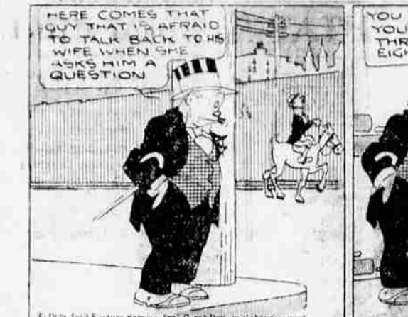
© 1929 Feature Syndicate, Inc. All rights reserved.