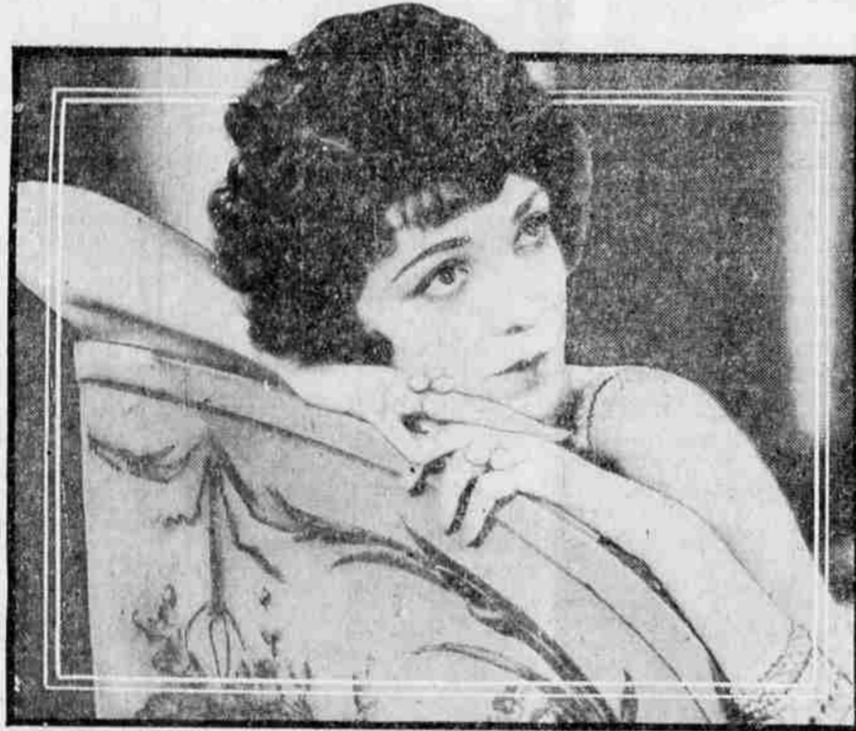
THIS UNUSUAL POSE OF LILA LEE emphasizes the talented young actress' beauty which has so captivated patrons of the "talkies." She's one of the screen's most popular misses.