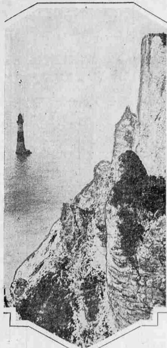
IT PROTECTS SEA-GOING PEOPLE, this lighthouse on the rocky cliffs of England does. This is an unusual picture of Beachy Head lighthouse, guardian of the cliffs near Eastbourne.