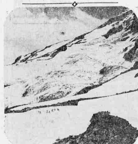
IT'S FLIRTATION WITH DEATH to attempt a journey on the snowfields of Mt. Rainier. Snowslides, slippery packs, and dangerous crevasses all signal danger but, in all, it fails to distract from the beauty of the peaks.