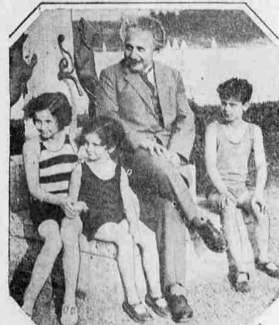
SAY EINSTEIN—and immediately one thinks of involved mathematical equations that very, very few understand. Yet this convinces one that the noted German scientist finds time to enjoy a moment of play as well as other men.