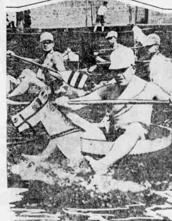
A HOSS RACE IN GERMANY—and what do you think of it? Bodies are wooden tubs, a board shapes the head, a pom pom makes the tail. Fun it is—and if you don't believe it, try it.