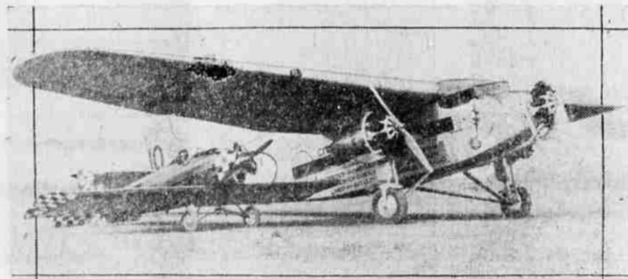
THIS IS A FLYING HANGAR. The big tri-motored Ford transport plane used on tours also serves as a hangar for the little ship at night. And it is easily noticed that there is quite a difference in size between the two planes.