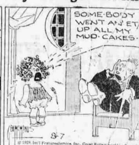
© 1929, Int'l Fratrascervice, Inc., Great Britain rights reserved.