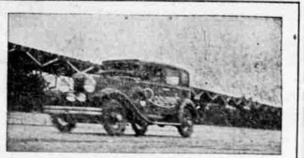
ROOSEVELT EIGHT FLASHING PAST STANDS on famous Indianapolis 2 1/2-mile brick track.

brought to an end not by any deficiency in the car itself but by a terrific storm which strewn the track of the Indianapolis Speedway with wreckage. The best previous record of non-stop car operation was 162 hours.