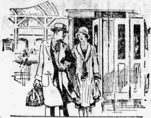
"I telephoned we would be there at six"

MANCHESTER, England (AP)—Two famous American surgeons, the Mayo brothers of Rochester,