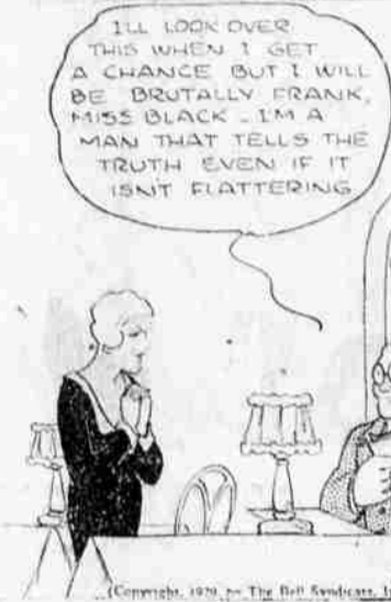
THE NEBBS—The Authress

FOR SALE—AUTOMOBILES. RENEWED TRUCKS. 1927 Type Federal-Knight 2-ton truck with flat bed and dual tires, 112.