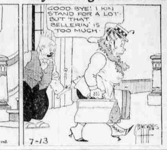
THE NEBBS—The Authress

PEAR ORCHARD—Out of town. Owner will sacrifice. 15 acres; $1000 cash, balance easy terms, 112.