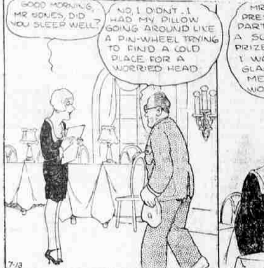
THE NEBBS—The Authress

GOOD MORNING, MR. NEBBS, DID YOU SLEEP WELL? NO, I DIDN'T. I HAD MY PILLOW GOING AROUND LIKE A PIN-WHEEL TRYING TO FIND A COLD PLACE FOR A WORRIED HEAD. MR. JONES I KNOW IT'S PRESUMPTUOUS ON MY PART, BUT I HAVE WRITTEN A SCENARIO FOR THE $1000 PRIZE MOVIE CONTEST AND I WOULD LIKE TO HAVE YOU GLANCE OVER IT AND TELL ME FRANKLY IF IT'S WORTH SENDING IN.