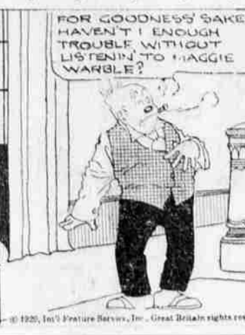
THE NEBBS—The Authress

FOR SALE—Completely equipped lunch room. Good location. Reasonable. Box 21, Tribune, 113.