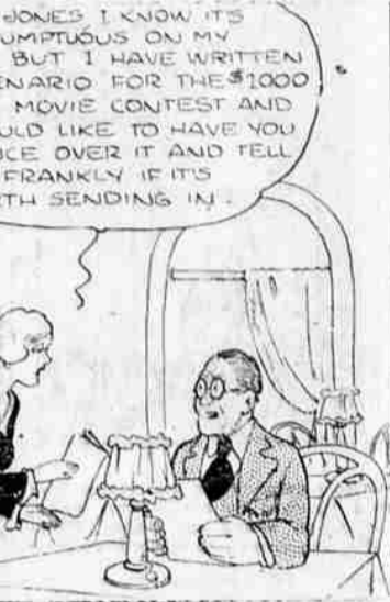
THE NEBBS—The Authress

FOR RENT—FURNISHED ROOMS. FOR RENT—Sleeping room, refrigerator and bath, modern, if desired, 132 Almond, 112.