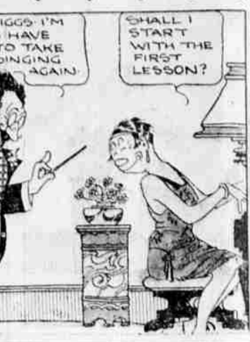
THE NEBBS—The Authress

FOR RENT—3-room cottage, furnished, modern, clean, inquire 25 No. Peach, $25, 1111-F.