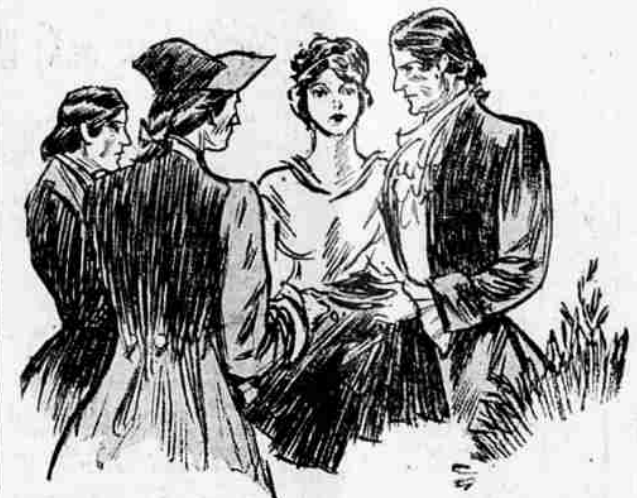
Sir Richard's cloak—blood-stained—found near Julian's body.

My lady Helen, who chose this moment to appear, returned the captain's salutation with courtesy far more gracious than usual. And in this moment came a demure young footman who, proclaimed, in voice unnecessarily loud: