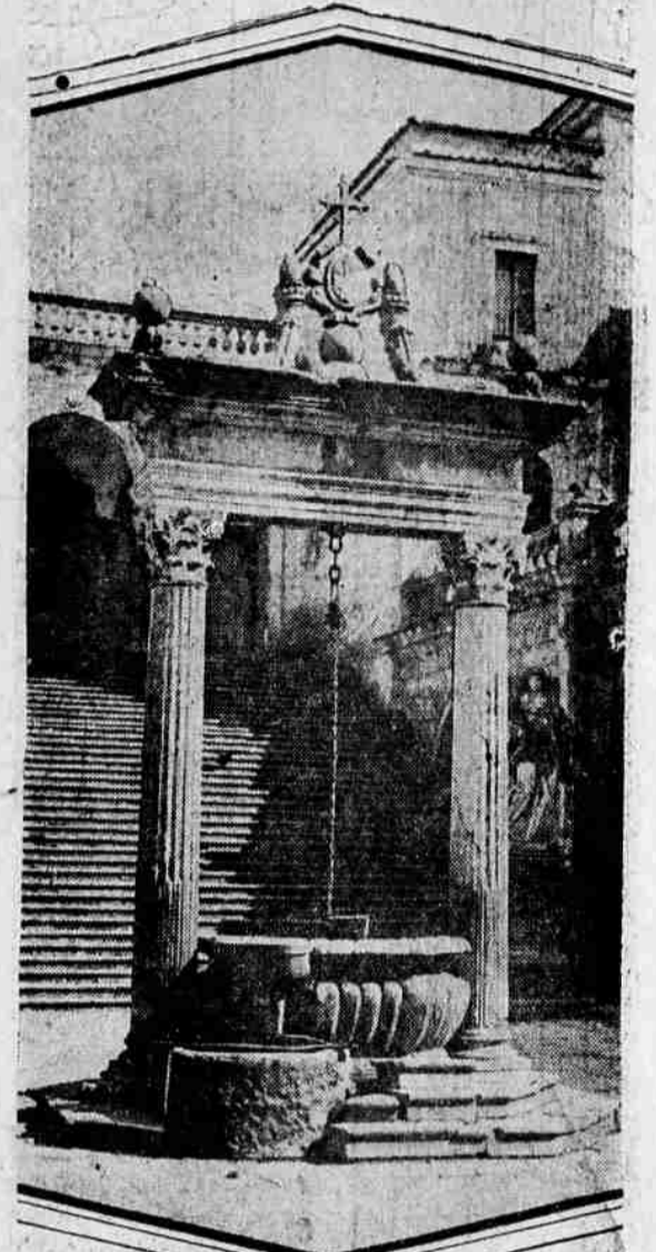
FOURTEEN CENTURIES OLD IS THIS WELL in the historic courtyard of the Abbey of Monte Cassino in Italy. It stands out artistically in its beautiful surroundings and is one of the chief points of interest to thousands of tourists each year.