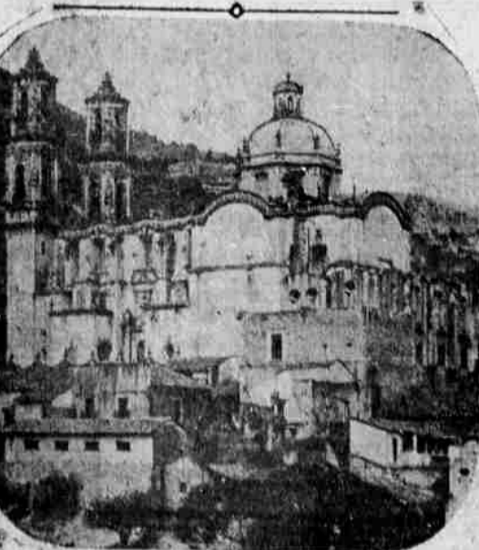
ONE OF THE MOST BEAUTIFUL CATHEDRALS in the world is this one in the ancient city of Taxco in Mexico. It was built in 1720 and stands today as originally finished. Its architecture is recognized as the finest of its kind.