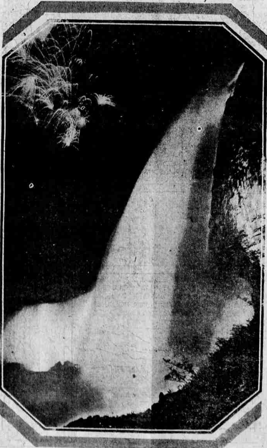
WHEN 1,320,000,000 CANDLEPOWER OF LIGHT was focused on Niagara Falls, this night scene of the thundering water was made possible. Bursting fireworks over the gorge aided in the effect. The mighty cataract was illuminated in this fashion, in celebration of Niagara Falls International Festival of Light, by W. D'Arcy Ryan, General Electric Company illumination wizard.