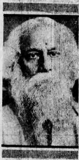
BACK TO INDIA went Sir Rabindranath Tagore, Indian poet and philosopher, after a visit to the United States. His chief observation of this country was that the present generation lives too fast a pace.