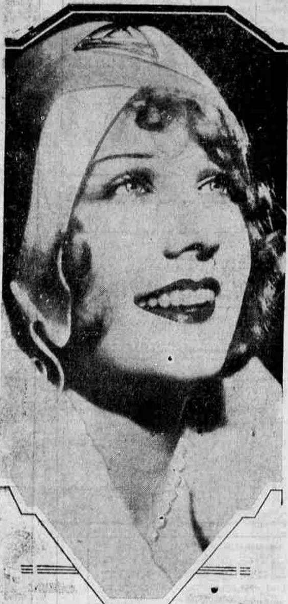
ONE OUGHT TO PAY FOR THIS SMILE and, come to think about it, most of us do. That is, we usually pay plenty to see Anita Page, young movie star, smile and do other things on the silver screen. But she's worth a few peeps.