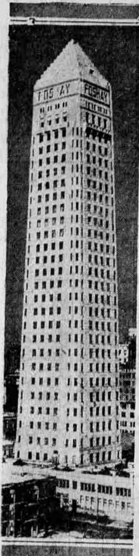
UNUSUAL IN STRUCTURE is this Minneapolis, Minn., building. It's the new Foshay building, patterned after the Washington Monument, that towers beautifully 32 stories high.