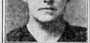
For Women of Middle Age

Two fires in the Santa Barbara national forest were subdued last night.