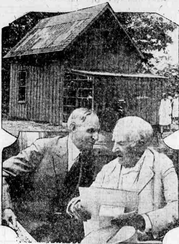
Thomas A. Edison's original workshop in which he developed the carbon filament electric lamp was presented to Henry Ford at Parsippany, N. J., for his Dearborn, Mich., museum. Mr. Ford (left) and Mr. Edison are shown below as they appeared at the ceremony.