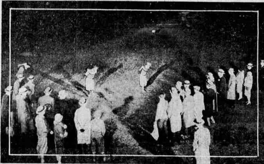
POOR OLD GOLF WIDOWS! They're in for lonesome hours if this spreads over the country. Here's a view at night of a practice course in Cleveland, O., which offers indulgence in this sport—24 hours a day if one wishes. Note the target bags in the background. It's one way to learn how to keep from "dubbing" your shots.