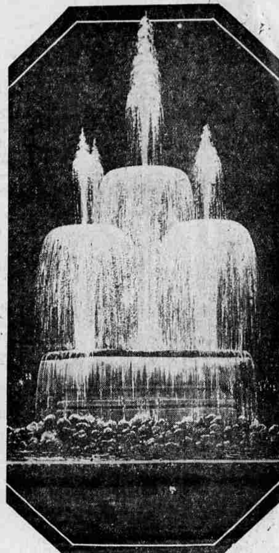
TINTED LIGHT RAYS coming from 30 submerged flood-light projectors, each equipped with color screens, as the water changes in height from various jets, makes this beautiful scene possible. The fountain was erected at Atlantic City by the General Electric Company for Light's Golden Jubilee celebration.