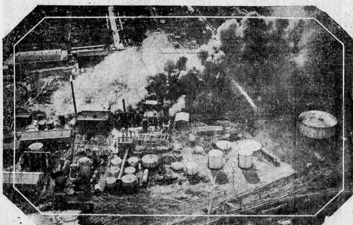
A KANSAS OIL REFINERY FIRE FROM THE AIR is pictured here, with the smoke from burning gasoline, tank cars and other property soaring lazily through the clouds. Approximately $100,000 damage was caused when this oil refinery at Kansas City, Kas., burned. Believe it truly, it was a mean afternoon, as all oil fires are, for the firemen when this happened.