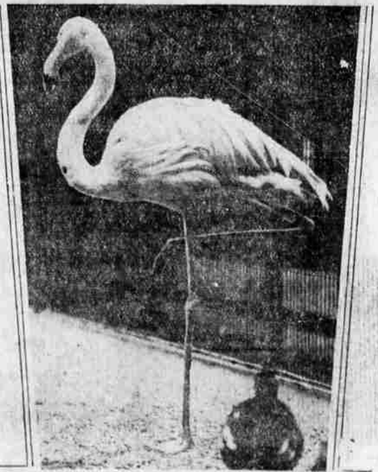
BEAUTIFUL LEGS? No, indeed, but probably the longest in captivity are these of Mister Crane. If one cares to see just what Mister Crane offers beauty in the way of pretty pins, just visit Philadelphia's zoo.