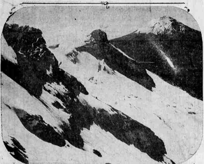
NOT IN SNOW-CAPPED SWITZERLAND, but high in the mountains of Mexico is this scene to be found. It's Mount Popocatepetl, taken from an altitude of 18,000 feet on the peak of Mount Iztaccihuatl, 40 miles away. It is one of the most beautiful mountain peaks in all of old Mexico.