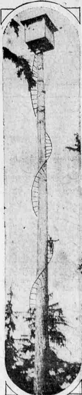
IT'S A HOME for a forest ranger, this tiny cabin atop a 170-foot Douglas fir tree in Washington. Steel bars, driven in the trunk and lashed by a cable, make the winding stairway around the trunk. And in this sits the ranger, shown halfway up the ladder, to watch billions of feet of lumber around him.