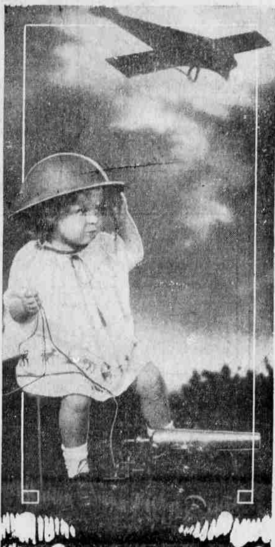
WHOOPEE ON JULY FOURTH does this wholesome youngster plan, and she's all ready for a glorious celebration of Independence Day. With her war helmet on, and her toy cannon ready to fire, and a real airplane flying gracefully about—well, the scene seems set for a big time.