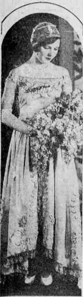
YOUR JUNE BRIDE a la Jean Arthur, of the cinemas, wears this enticing ensemble of ivory satin, trimmed with garlands of silver and satin leaves. A Juliet cape of lace and satin is worn instead of the usual veil, but a long train of silver cloth and pearls falls from the shoulder. The gloves are very recent from Paris and complete a charming picture.