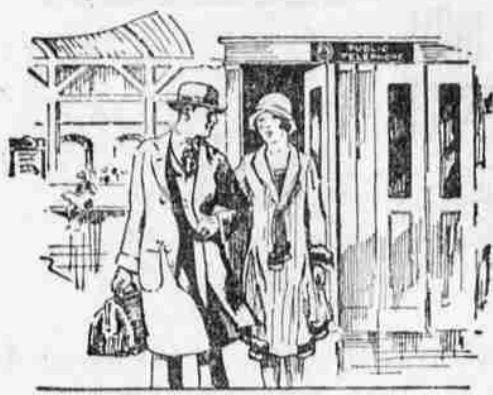
"I telephoned we would be there at six"