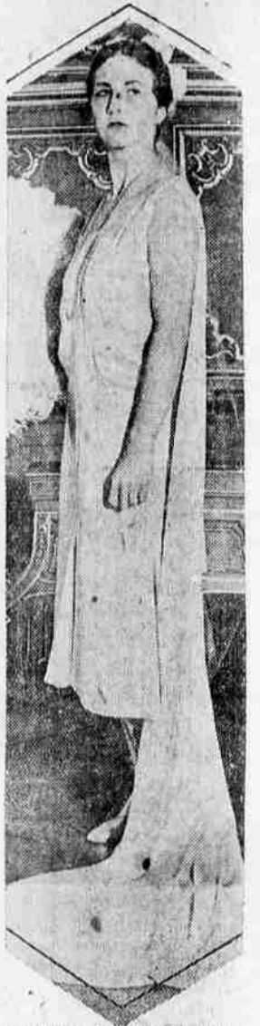
WHEN HELEN WILLS , world's foremost woman tennis player, was presented to the English court recently, she was dressed in this manner. The gown is an ensemble of ivory white satin.