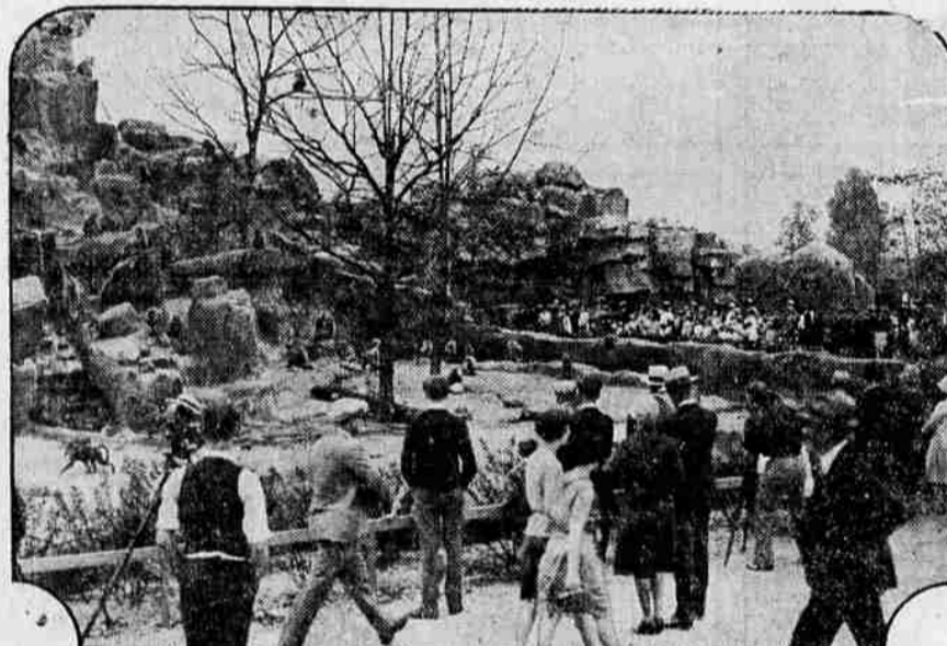
YES, THIS IS MONKEY BUSINESS , and plenty of it. One hundred and fifty-five Abyssinian baboons were turned loose in new quarters at the Detroit zoo recently. The quarters offer an unobstructed view to spectators, and, as a result, the monkeys' playground seems to be the most popular spot around the zoo.