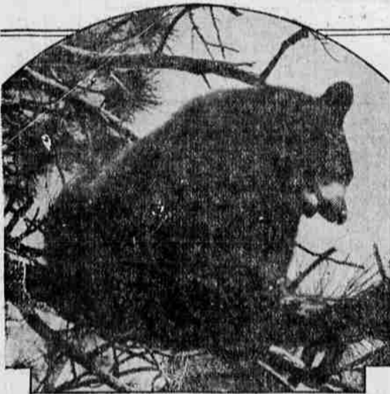
APPETIZING ODORS of frying bacon attracted the attention of this grizzly in his high perch in a tree, and he wants some. Being a pet bear in one of the large western parks, campers usually fulfill his wants.