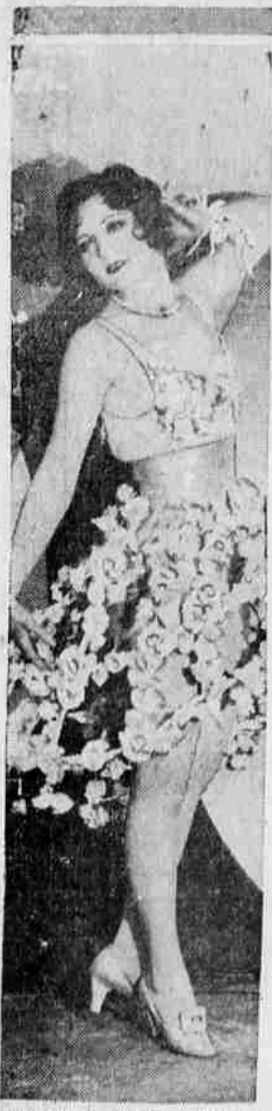
MOST APPEALING does Nancy Carroll, young cinema actress, seem here. She is wearing the costume in which she appears in the film "Burlesque."