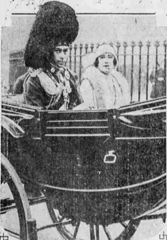
STRAW HAT SEASON, EH? Well, not to the Duke of York. The Duke and Duchess are pictured here in their coach at Edinburgh. The Duke is wearing the official costume of Lord High Commissioner to the General Assembly of the Church of Scotland.