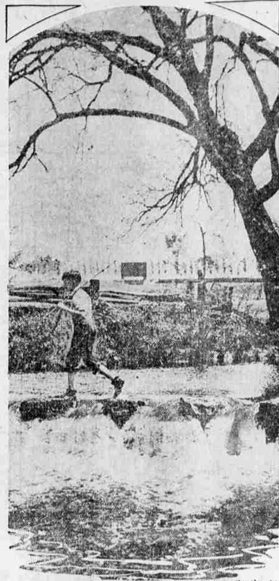
HAPPY DAYS ARE THESE , as every one knows, that this youthful disciple of Izaak Walton is enjoying near Kansas City, Mo. He seems to have discovered a most beautiful spot for his fishing, from the looks of the scenery.