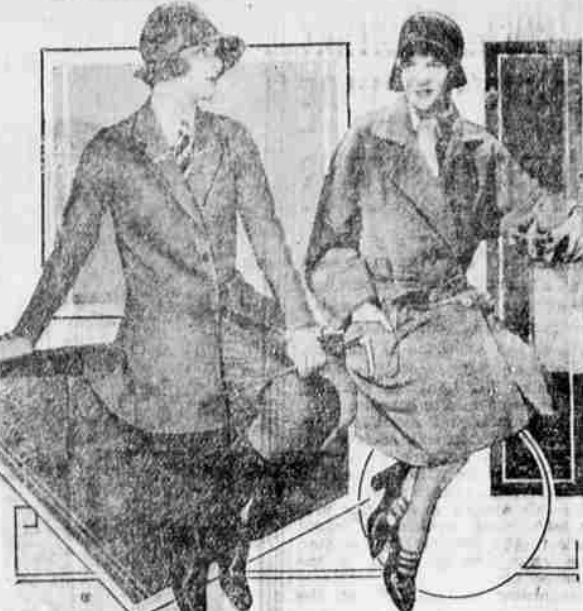
On the left is an attractive new riding habit smart for country riding. The new Brampton coat, an attractive light coat for travel, from Franklin Simon is shown on the right.