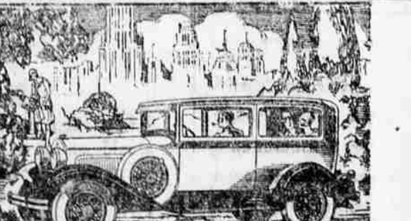
The Full-Size Plymouth 2-Door Sedan, $675 Special equipment extra

A capital instance is furnished by a statement coming from that august and learned body, the supreme court of Vermont. Called upon to determine a point relating to a popular and succulent article of food, the court observed: