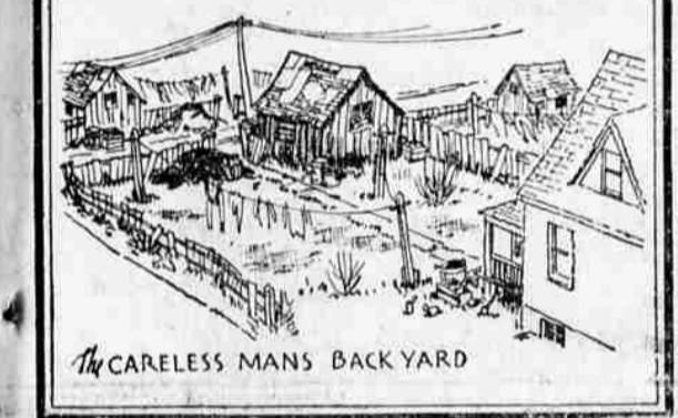
THE CARELESS MANS BACK YARD