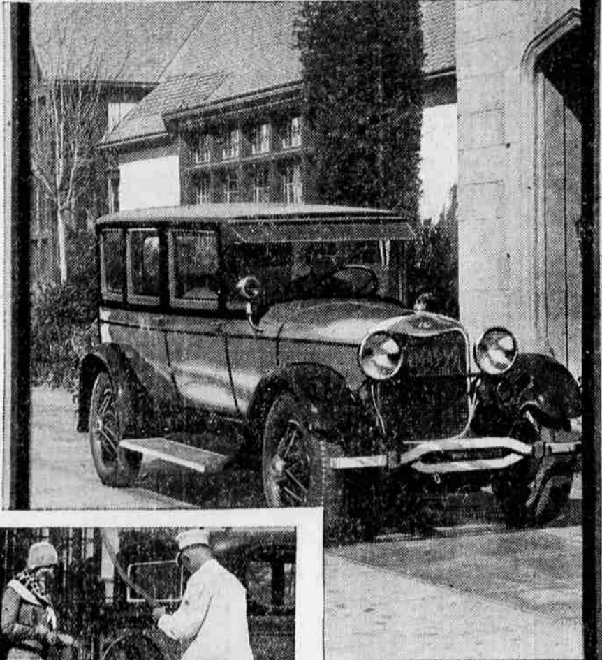
This beautiful seven passenger Lincoln is hard driven but it gets very good care. Blodgett keeps it running sweetly on Shell 400