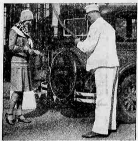
Notice the cars at Shell stations. Cars that show care—not all new or expensive makes by any means, but driven by thoughtful people who know the sound value of Shell 400, the "dry" gas