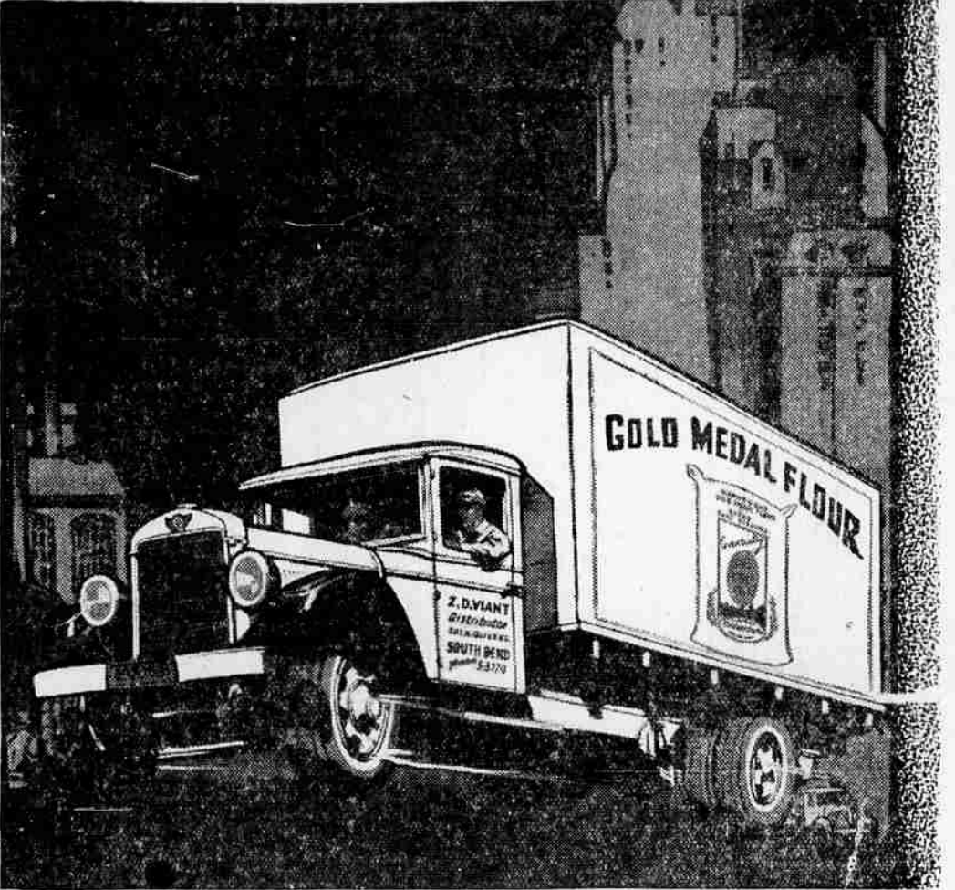
3-ton Reo Speed Wagon in service of Z. D. Viant, distributor of Gold Medal flour in South Bend, Indiana

INDUSTRY long wanted this revolutionary im- provement in medium and heavy duty transpor- tation to meet the new demand for increased daily mileage output. Unprecedented sales prove it con- clusively. Here are 1 1/2 to 3 ton Speed Wagons that offer speed, power, flexibility, economy and long life heretofore unknown in their field. They mark a new era. An era of pleasure car per- formance in 1 1/2 to 3 ton hauling. And in the short time since their announcement they have established a sales record probably without equal.