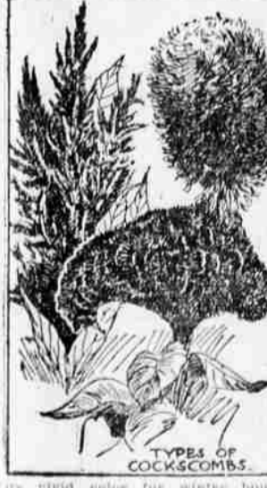
TYPES OF COXCOMBS

Flounder or Sole Flounder is a name applied to a large group of fishes which have the body compressed, both eyes on one side of the head. The blind side usually is colorless, resting on the water bed. A name often applied to the flounder family, flatfish are white-meated, lean food fish.