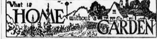
What is HOME without a GARDEN

There was once upon a time two brothers. One was named Careful and one was named Careless. They lived on a hill. Below this hill was a village called "Quiet Village."