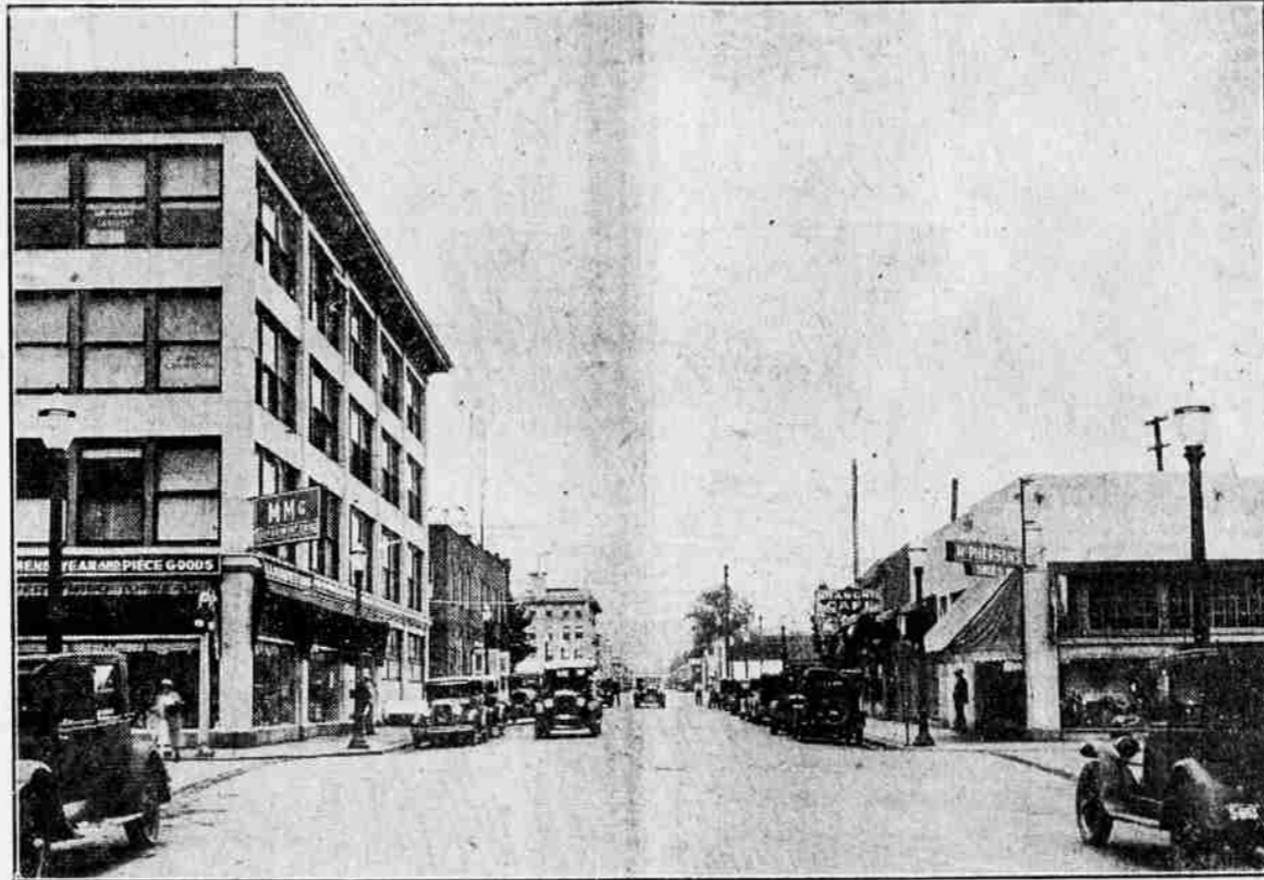
Looking west on Sixth street with new lighting standards in right and left foreground. Six lights will shed brilliance in each block of the business artery.

vision for the length of the street. Trees, which had grown on parking lots, are in the course of removal, making Sixth street a metropolitan-appearing thoroughfare.