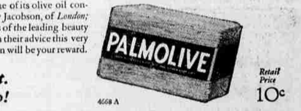
4668 A Retail Price 10c