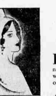
Spanish beauties have long known the cosmetic value of olive oil.

Regular cleansing twice a day with Palmolive Soap is my advice to my clients. The effect of the pure palm and olive oils in this soap keeps the skin always in the proper condition.