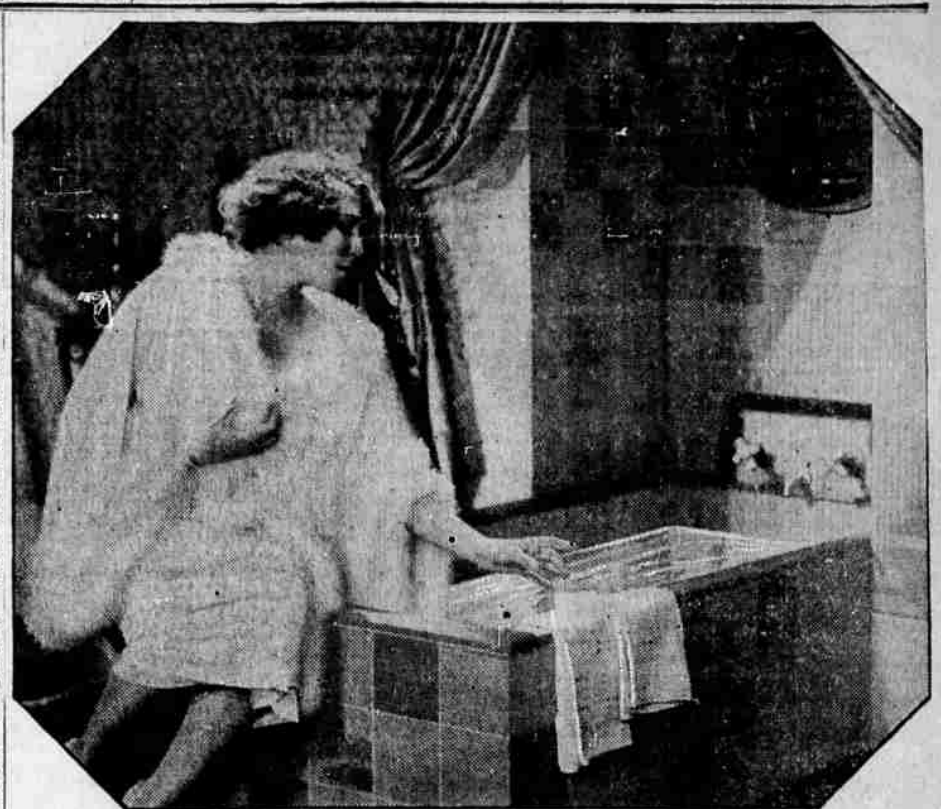
LOUISE FAZENDA, star with Warner Brothers, in the charming tiled bathroom built for her in Hollywood from the original design by a prominent New York artist. She keeps her skin flawlessly smooth for the close-up by using Lux Toilet Soap. She says: "I used to use the fine French soaps, but I find that Lux Toilet Soap gives the same beautiful smoothness to my skin. I am devoted to it."