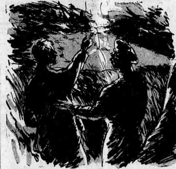
A startling discovery—a vein of quartz "rotten with gold!"