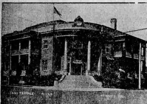
Medford's beautiful Elks Temple at Fifth and Central avenue will be the scene of the Grand Encampment on Tuesday, the Grand Lodge on Tuesday evening, and the Grand Lodge session on Wednesday.