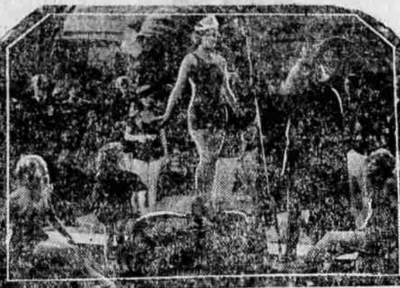
Scene From 'THE COHENS AND KELLYS IN ATLANTIC CITY'