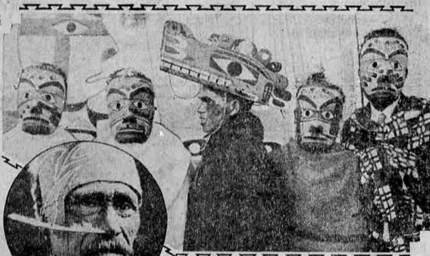
ISLAND INDIANS OF BRITISH COLUMBIA got all dressed up recently for the occasion of the visit of the Governor General, Viscount Willingdon. Notice the feather through the pierced nose of the old brave shown in the inset.