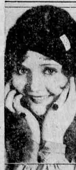
LOOKS LIKE A BAD year to become engaged, especially in Hollywood where twin rings are the vogue. Nancy Carroll is shown with a couple of the circlets, of carved jade set in platinum.