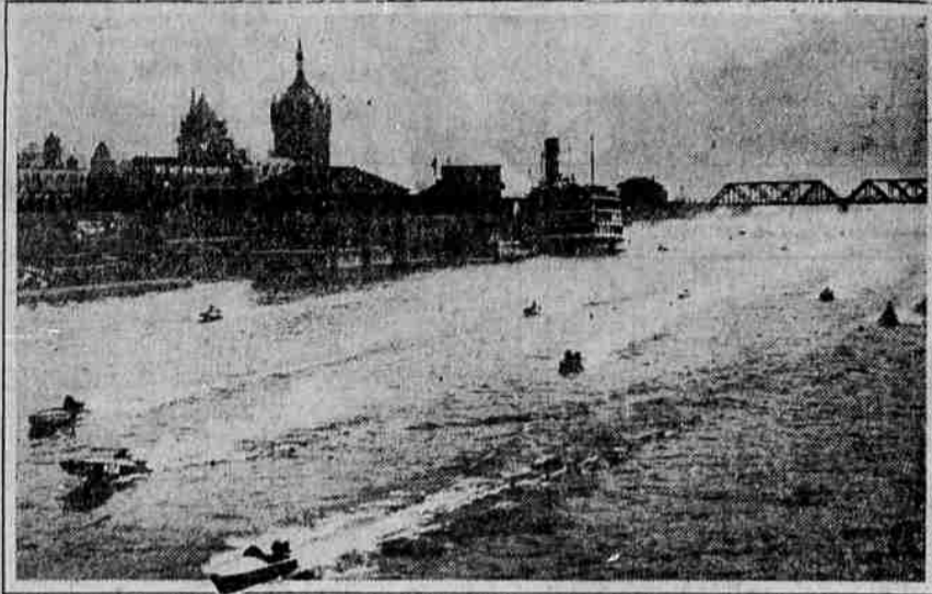
SWISHING ALONG THROUGH THE HUDSON RIVER at a 45-mile-an-hour clip, these outboard motor racers covered the 132.25 miles from Albany to New York City in slightly more than three hours and a half. The start of the race at Albany is pictured above.