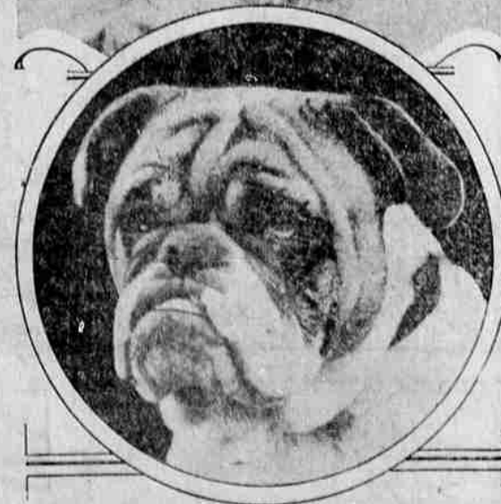
HERE ARE THE HERO AND VILLAIN of the cast as exhibited at a recent dog show in London. "Inveresk Cashier," above, won six first prizes and the championship of the spaniel's class. "Cracker Jack," below, won first prize among the bulldog puppies.