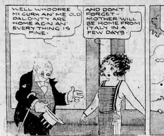
THE NEBBS—Sign Off