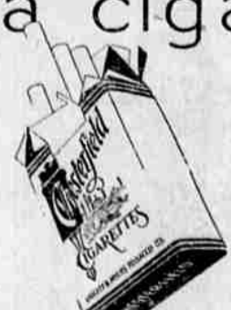
MILD and yet THEY SATISFY