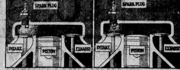
The hot, intense spark from a new spark plug thoroughly ignites the cylinder mixture of gas and air. A weak spark has the intensity to ignite the mixture fully. This is the beginning of imperfect combustion.