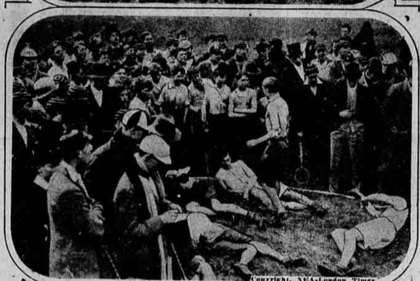
MOST COLORFUL OF ENGLISH COLLEGE AFFAIRS is the Eton Steeplechase. Above, the boys are shown taking the brook in the Juniors' race. Below, some of the Juniors are watching Senior runners stretched out at the finish of the strenuous event.