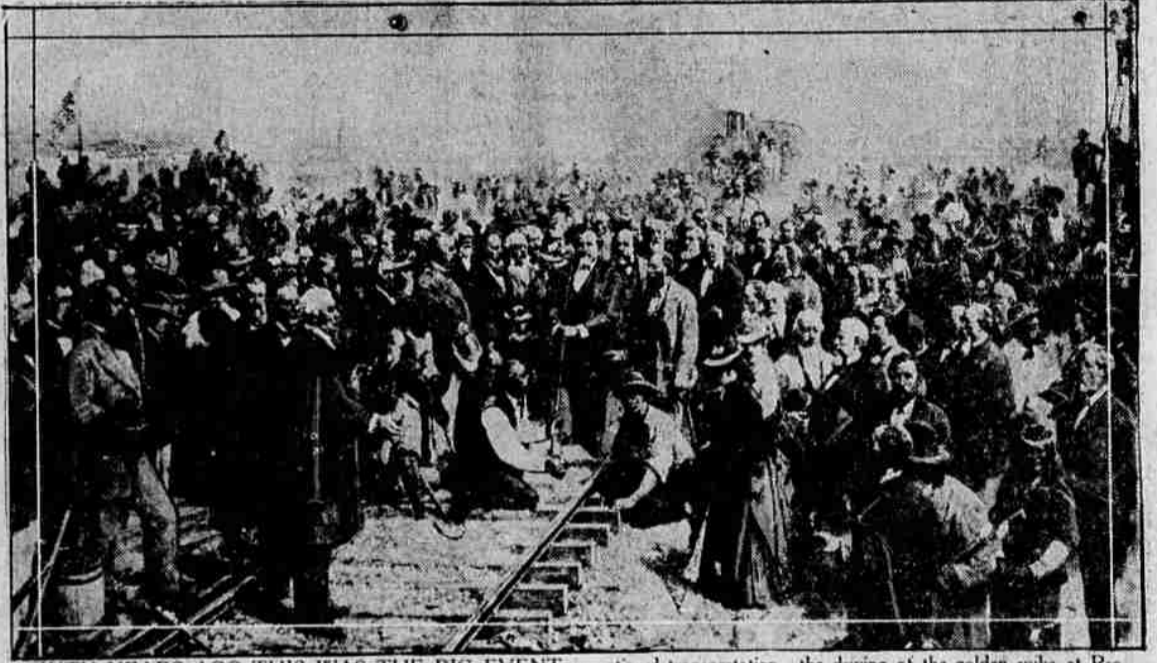
SIXTY YEARS AGO THIS WAS THE BIG EVENT in national transportation—the driving of the golden spike at Promontory, Utah, completing the first transcontinental railroad. Senator Leland Stanford of California is shown standing with the maul while another man kneels to hold the spike in position for him to drive it.