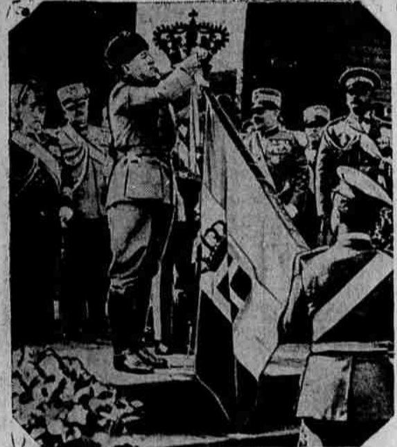
THE ITALIAN ROYAL AIR FORCE is one of Premier Benito Mussolini's cherished pets. Il Duce is shown decorating the standard of the corps with a silver medal at the recent seventh anniversary celebration of the founding of the force.