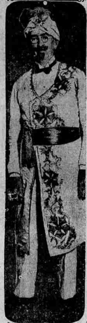
MAYBE THIS REMINDS you of "The Sultan of Sulu." George Ade's play of twenty years ago. Anyway, it's George Ade himself, photographed at Manila recently at a fancy dress ball on the Belgenland, in which the author was making a world cruise.