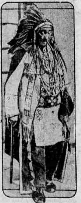
CHIEF WHITE HORSE EAGLE, picturesque American Indian, is shown as he strolled along the streets of Paris recently. The chief likes his cigar.