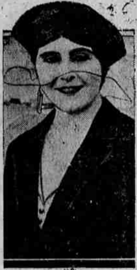
LADY DRUMMOND HAY, English journalist and the first woman to fly across the Atlantic Ocean in the Graf Zeppelin, is shown here as she returned to New York the other day, wearing an odd veil from London.