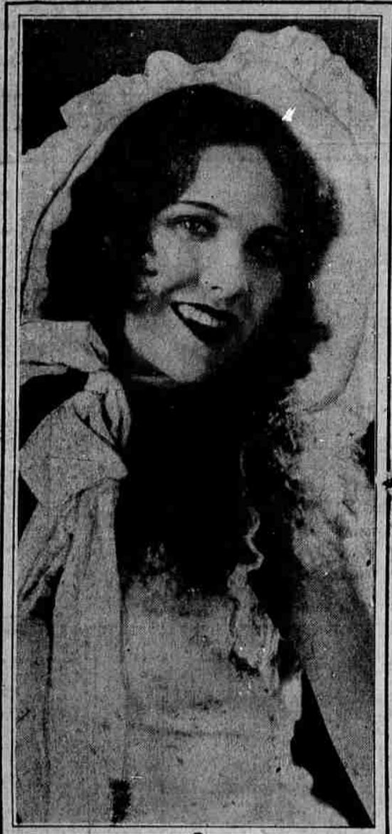
QUITE A FEW IN HOLLYWOOD are wearing sunbonnets this summer. Here is Mary Brian as a little country girl.