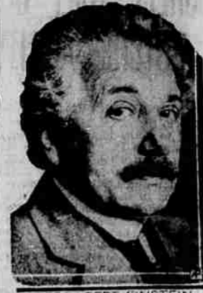
PROF. ALBERT EINSTEIN