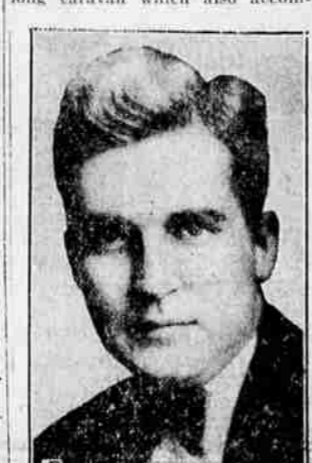
Paul V. McNutt

Following the luncheon the national leader was brought to Medford by automobile as part of a long caravan which also accom-