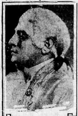
TITO SCHIPA ATWATER KENT ARTIST

From the quiet cloisters of a seminary in Italy, where he was preparing for the life of a priest, to a palace among the homes of famous motion picture stars just outside Hollywood—that is the transition that his voice made for Tito Schipa, operatic tenor, who will be heard this Sunday evening in the Atwater Kent radio hour.