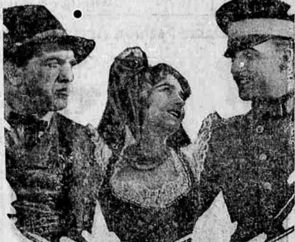
VILMA BANKY in "THE AWAKENING" with LOUIS WOLHEIM and WALTER BYRON

"The Awakening," coming to the Rialto theatre tomorrow, marks the first appearance of Vilma Banky as a star in her own right. In this story of war and romance in Alsace, she plays the role of a young girl who is shown her in a succession of romances of the past, in the role of a simple Alsatian peasant girl meeting her first love in the days just preceding and immediately after the outbreak of the World War.