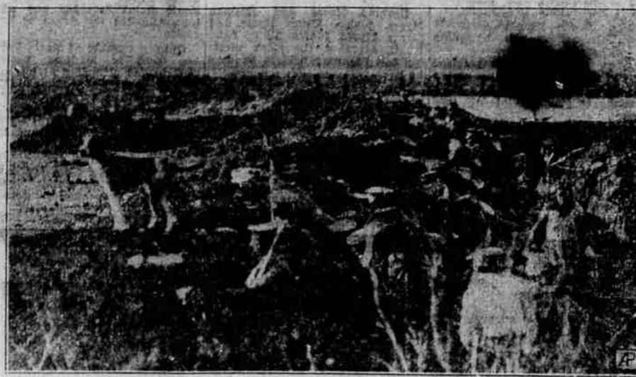
The yellow and white mongrel (left) who, during the attack on the federal outpost of Iaco, Gonzara, skipped along the trenches, stopping occasionally to dig where a bullet kicked up the dust. At right, one of the women who braved bullets to carry food to the defenders of the border town.