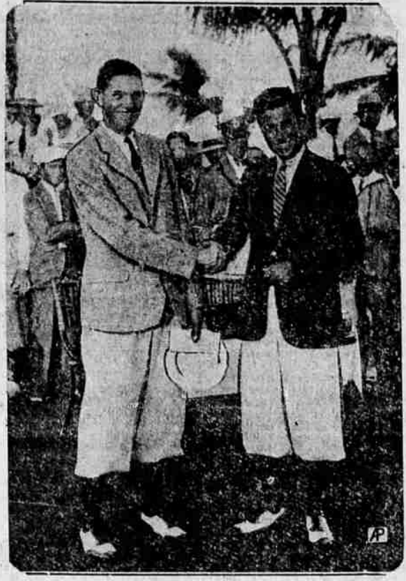
Johnny Farrell (right) congratulating Horton Smith, 20-year-old professional of Joplin, Mo., winner of the $15,000 La Corce open golf tournament at Miami Beach, Fla. Smith recently was selected one of the two new members of America's Ryder cup team.