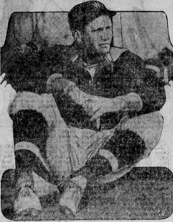
Walter Johnson, manager of the Washington Senators, in the dugout at Tampa, Fla., watching rookie talent in a pre-season game with the Boston Braves.