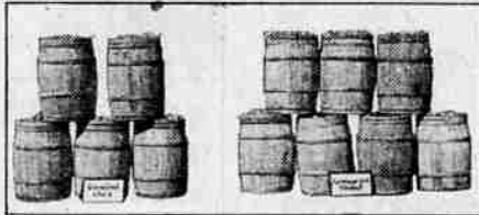
Comparative Yields from One-Tenth Acre Plots.

C. E. Randolph of Aroostook County, Maine, discarded the old-fashioned, time-consuming soak method of seed treatment in favor of Semesan Bel instantaneous dip.