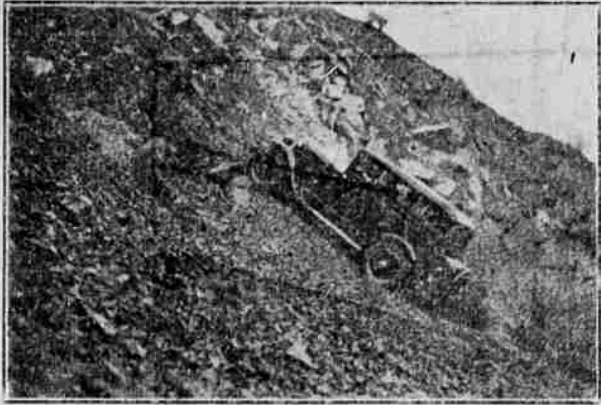
A stock model Essex car making a 32 per cent grade near Jacksonville.