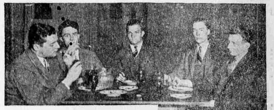
The upper-classes comparing the leading cigarette brands in the rooms of the Princeton Inn.

"The Daily Princetonian" was asked by the P. Lorillard Company, makers of OLD GOLD cigarettes, to conduct a test at Princeton to determine which of the four widest-selling cigarettes had the greatest taste appeal. For the purposes of the test the four leading cigarettes were "masked" to conceal the brand names. Undergraduates were asked to smoke the four brands without knowing their identity. The cigarettes were numbered, and the men merely chose, by number, the one that appealed to them most. The test was made at eleven Princeton upper-class clubs and at the Freshman Commons on January 11th to 16th. In all, 303 students smoked and compared the four cigarettes. The test was conducted in a perfectly fair and impartial manner. The results show that "Cigarette W" won 75 first choices; "Cigarette X" won 74; "Cigarette Y" won 36; and "Cigarette Z" (which was OLD GOLD) won 118. The preference for OLD GOLD was 57% greater than that for the next highest brand.