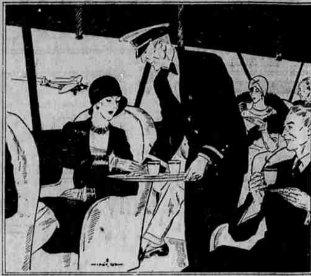
SERVING M-J-B COFFEE ON DE LUXE PLANE OF WESTERN AIR EXPRESS, CALIF.

M-J-B is vacuum-sealed in the new improved friction top key-cans by M-J-B's own exclusive process. Ask for M-J-B Coffee at your grocery. Look for the letters on each can.