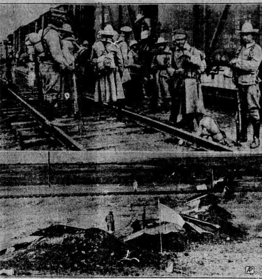
Trench fortifications of federal soldiers at Naco, a Mexican town eight miles from Bisbee, Ariz., are shown below. Mexican rebel soldiers (above) are loading on a troop train for Naco.