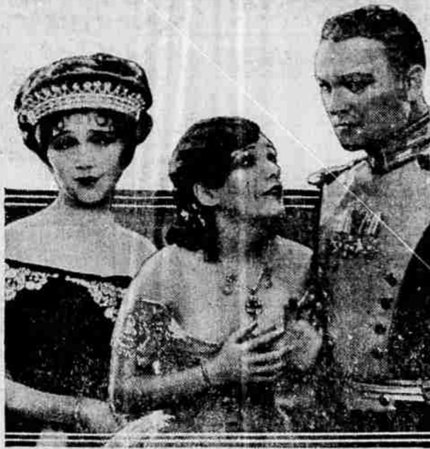
WILLIAM BOYD, JETTA GOUDAL, LUPE VELEZ, D.W. GRIFFITH'S 'LADY OF THE PAVEMENTS'

As the Emperor's mistress in an age of decadent luxury under the French imperial regime, Jetta Goudal shines as a great lady in this picture. Lupe Velez and William Boyd are the other principals. Lupe is a street singer, and Boyd is an arrogant young officer.