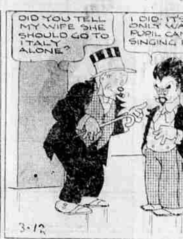
DID YOU TELL MY WIFE SHE SHOULD GO TO ITALY ALONE?