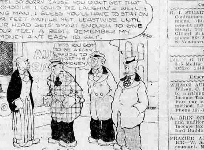
YES YOU GOT TO BE A FOPPIE TO GET HIS MONEY.