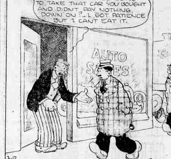
WHEN ARE YOU GOING TO TAKE THAT CAR YOU BOUGHT AND DIDN'T PAY NOTHING DOWN ON? I GOT PATIENCE BUT I CAN'T EAT IT.