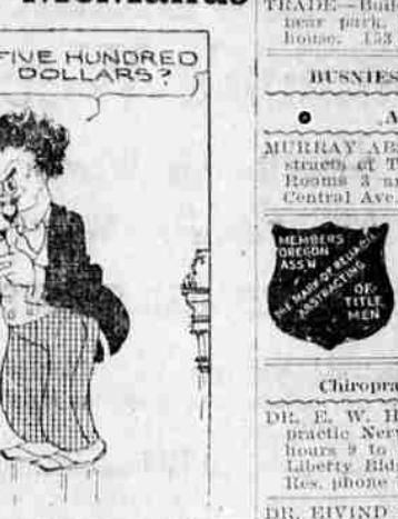
AN THE DAY SHE GETS ON THE GOAT I'LL GIVE YOU ANOTHER ONE FIVE HUNDRED DOLLARS?