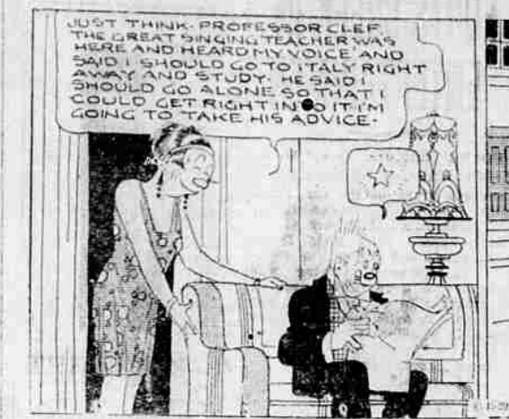
JUST THINK, PROFESSOR CLEF THE GREAT SINGING TEACHER WAS HERE AND HEARD MY VOICE AND SAID I SHOULD GO TO ITALY RIGHT AWAY AND STUDY. HE SAID I SHOULD GO ALONE SO THAT I COULD GET RIGHT IN TO IT AND GOING TO TAKE HIS ADVICE.