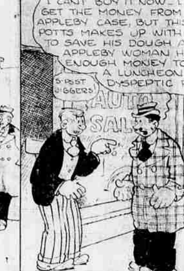
I CAN'T BUY IT NOW - I EXPECTED TO GET THE MONEY FROM THAT POTTS-APPLEBY CASE, BUT THIS OLD TOTTWAD POTTS MAKES UP WITH HER IN COURT TO SAVE HIS DOUGH AND THIS APPLEBY WOMAN HASN'T ENOUGH MONEY TO GIVE A LUNCHEON TO A DYSPHEPTIC FLY.