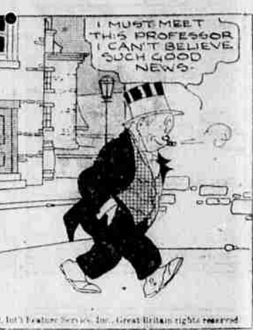
I MUST MEET THIS PROFESSOR I CAN'T BELIEVE SUCH GOOD NEWS.