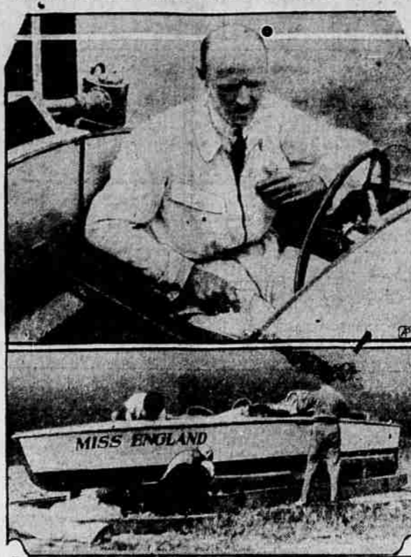
Maj. H. O. D. Segrave, England's speed champion, at the wheel of Miss England, 1,000 horsepower sea sled, at Daytona Beach, Fla. He will attempt to wrest the record from Gar Wood's Miss America II at Miami in March.