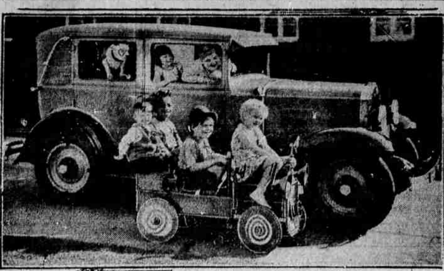
No one appreciates any more than these famous kids of movieland the advantages of both open and closed cars. The Chevrolet Landau has the advantages of both as it is convertible. In the "open car" are Jean Darling, Harry Spear, Farina and "Wheeler". The Landau holds Joe Cobb, Mary Ann Jackson and "Pete".