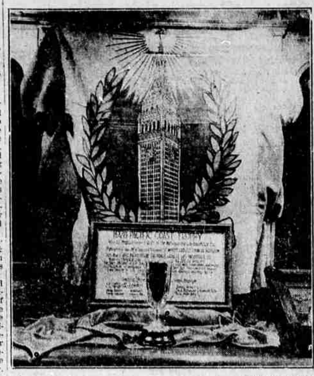
Attractive window display at Brophy's jewelry store in this city showing the trophy won by the Southern Oregon district of the Metropolitan Life Insurance Company.

Competing with districts from seven Pacific coast states, Medford has been awarded a trophy for one year's outstanding Metropolitan Life insurance activity.