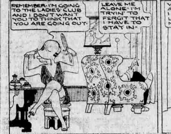
THE NEBBS—It's No Use