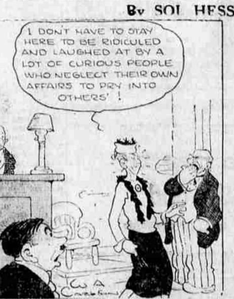
Copyright 1929 by The Bell Syndicate, Inc. Trade Mark Reg. U. S. Pat. Office.

Street in said City, which point bears 153.42 feet from north 30 feet from the Southeast corner of D. L. C. No. 42 in Township 37 South, Range 1 West of the Willamette Meridian, and the place within said Territory proposed to be annexed at which the polls will be taken in said City, which point bears 117.45 feet and North 556 feet from the Southeast corner of D. L. C. No. 42 in Township 37 South, Range 1 West of the Willamette Meridian; thence South along said Lindley Street 120 feet; thence West 100 feet; thence North 100 feet to the South line of said Reddy Avenue; thence East along said Reddy Avenue 100 feet to the place of beginning; and declaring any and all claims to be null and void, and decreeing that said plaintiff is the owner in fee simple of said premises and of the whole of the hereinafter described premises, and that each and all of the defendants herein are to be and are, and each and all of them, be forever enjoined, restrained and prohibited from asserting, attempting to establish, or claiming any right, title, estate, lien or interest in or to said property, or in any part thereof, and that plaintiff's title to said premises be forever quieted and set at rest.