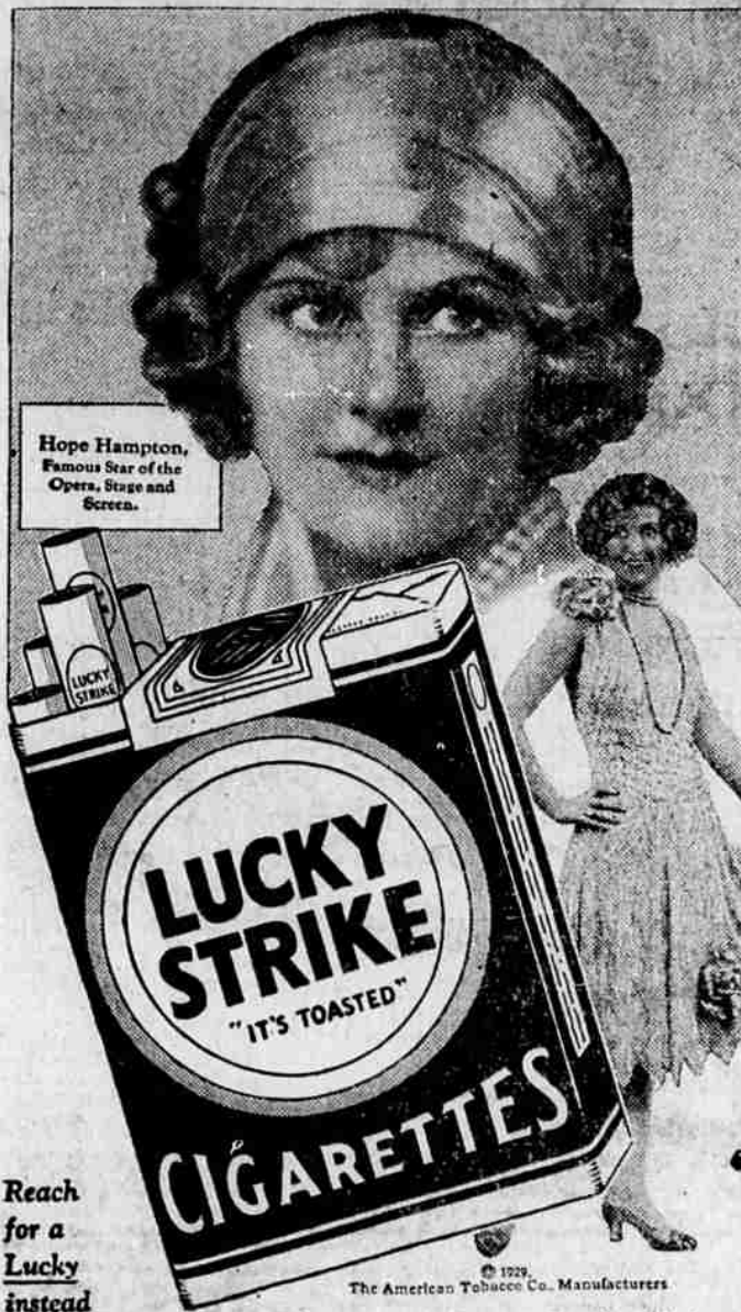
Hope Hampton, Famous Star of the Opera, Stage and Screen.

"Luckies have helped me win the laurel crown of my musical career—singing in opera. Stage presence demands a slim, youthful figure. Rich foods cannot tempt me. I light a Lucky and stay slender. The toasted flavor of a Lucky soothes the craving for goodies. Then, too, a Lucky never irritates my throat. Even, after smoking many, my voice is still clear."