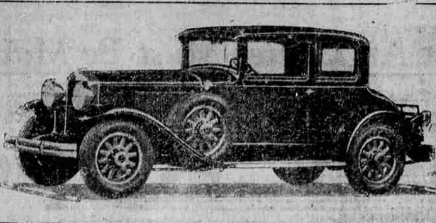
The new 1929 Graham-Paige straight 8, one of the popular models handled by the Crater Lake Automotive Company of this city.

A new high record for sales volume attained by a new make of automobile in its first year was created by the Graham-Paige Motors corporation in producing cars to a total retail value of more than $50,000,000 in 1928, according to an announcement from the company received by Crater Lake Automobile Co., the Graham-Paige representative in Medford. The second year of Graham-Paige finds the company well on its way to creating new records with its line of new styles and models, as indicated by the figures for January, when 5670 cars were built, nearly four times the total for January last year. In fact, Graham-Paige is already a full month ahead of 1928, as the first month's output this year exceeded the total for the first two months of the preceding year.